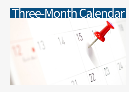
Click here to download