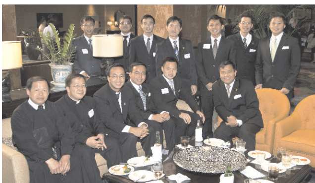
Redemptionist Seminarians at the Bishop's Dinner

He saw that we were now living in a culture, in a world, which was, as he termed on at least four occasions, the post-Christian era, a stunning term,