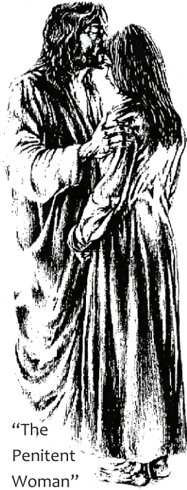
“The Penitent Woman”

“I have hope now. I had not felt that before. I didn’t even believe there was forgiveness for what I had done. Now I know differently.”